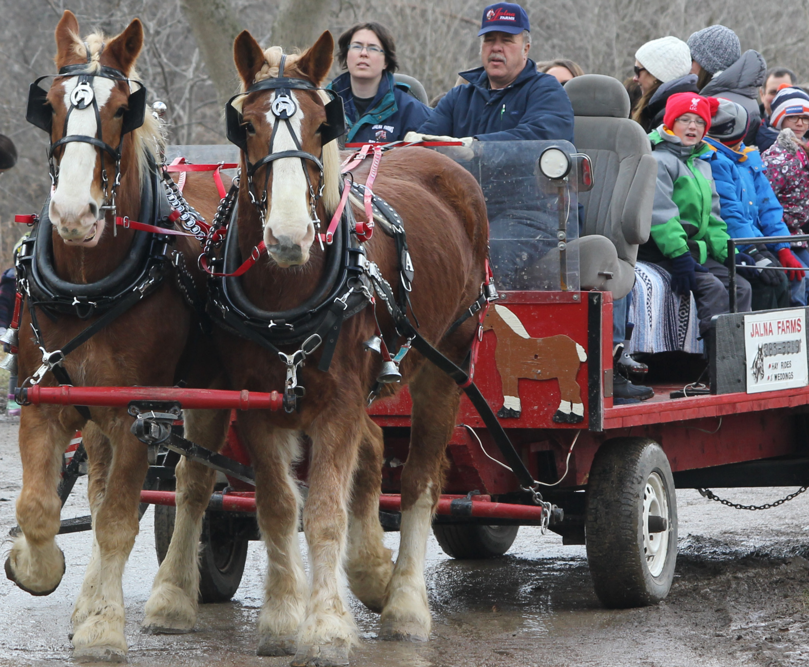
Maple Syrup Festival at the A.W. Campbell Conservation Area | St. Clair Region Conservation Authority