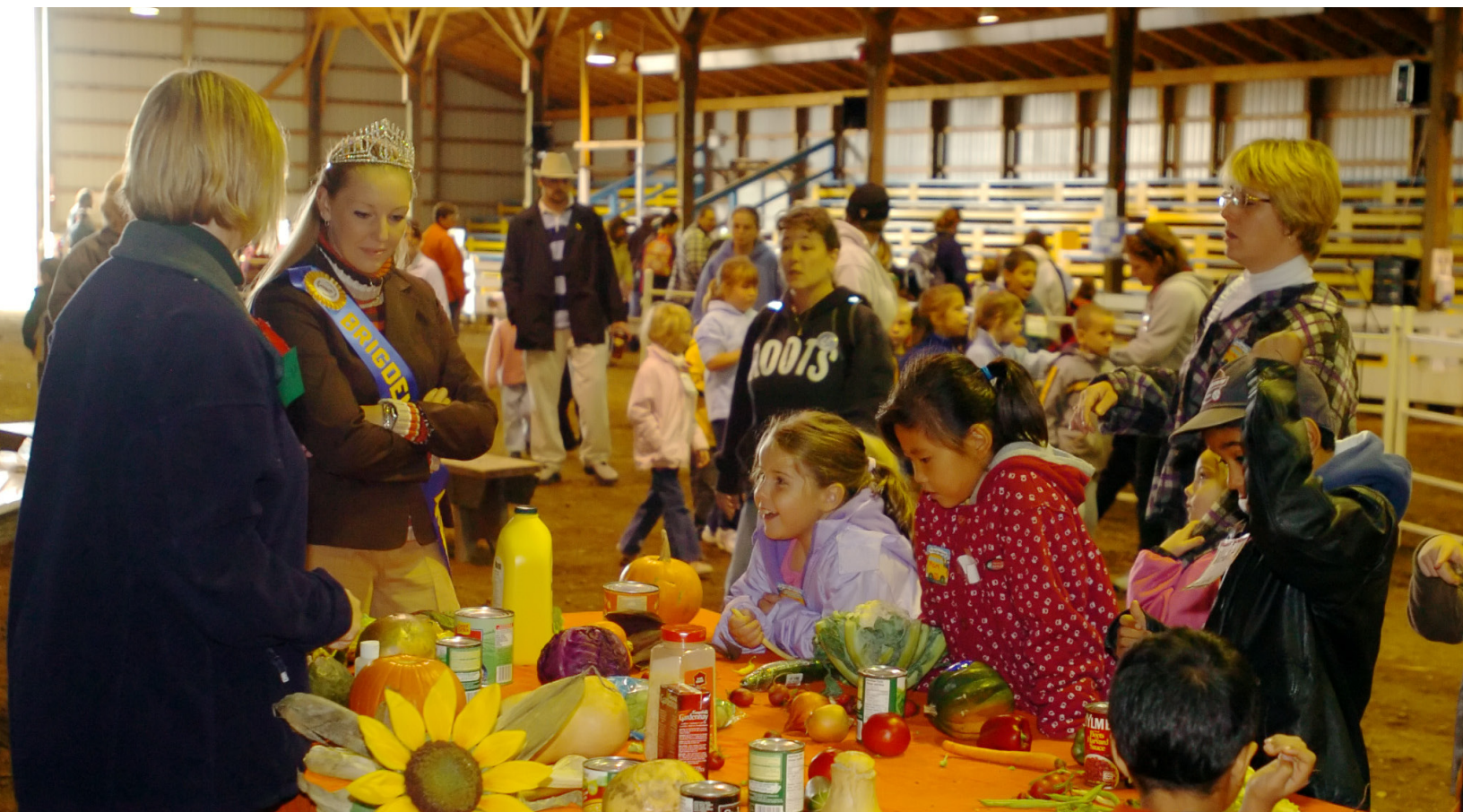
Brigden Fair