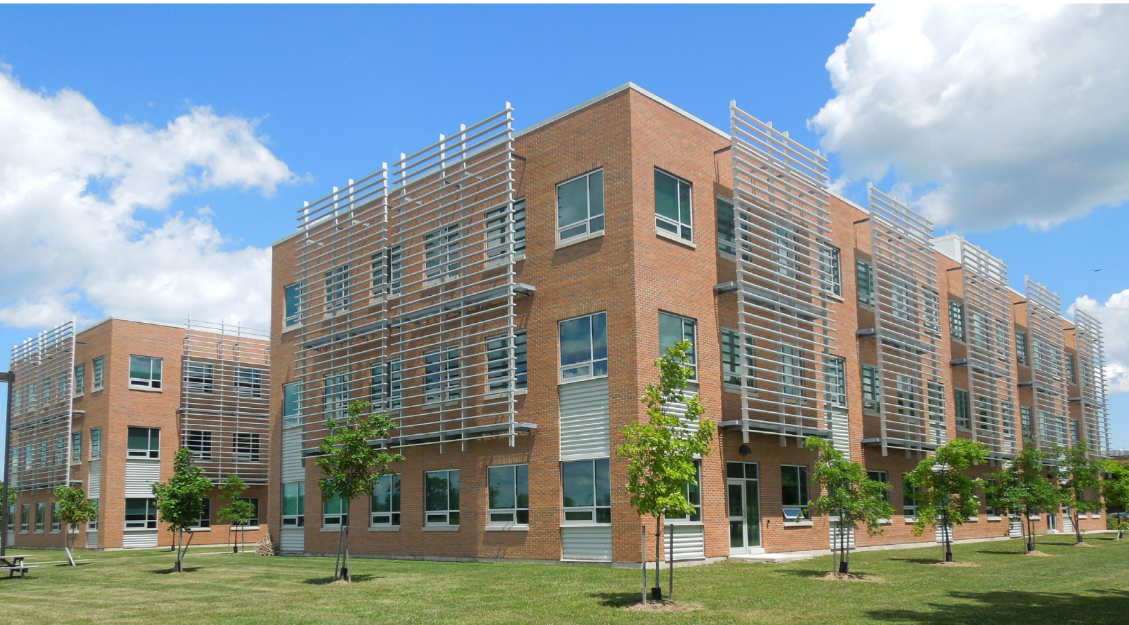
Western Sarnia-Lambton Research Park | County of Lambton